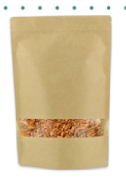
12+6x20cm REF. 12799-50