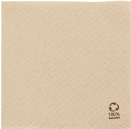
Paper Napkin Eco-Friendly Embossed 30x30cm 1 Layer REF. 5023-100