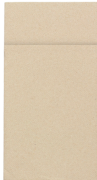
Cutlery Pocket Fold Napkin de Papel Eco 40x40cm REF. 8968-60