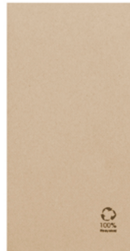
Paper Napkin Eco 1/8 40x40 2C REF. 5014-50