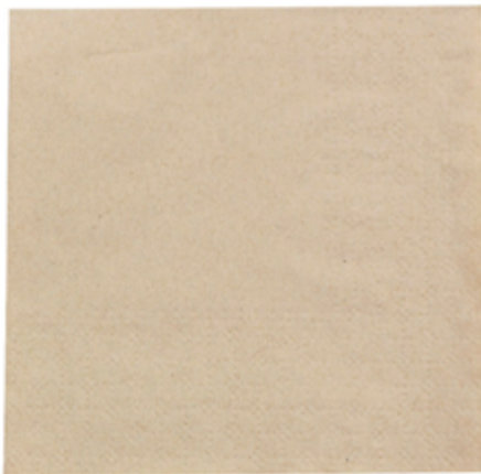
Paper Napkins Eco-Friendly 20x20cm 2C REF. 5012-100