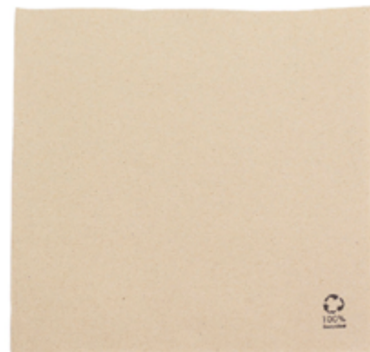
Paper Napkin Eco 40x40cm 2C REF. 5013-50