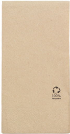
Paper Napkin Eco-Friendly 1/8 40x40cm 2C REF. 5022-50