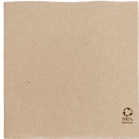
Paper Napkin Kraft 2C 33x33cm REF. 8990-50