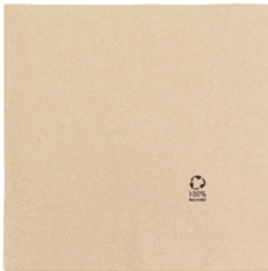
Paper Napkin Eco-Friendly 40x40cm 2C REF.5021-50