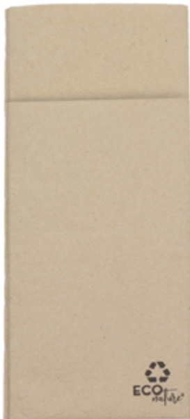
Cutlery Pocket Fold Napkin de Papel Eco 32x40cm REF. 12841-30