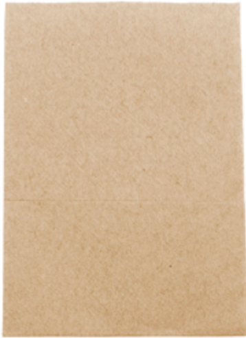
Miniservis Paper Napkins Eco-Friendly 17x17cm REF. 5011-100