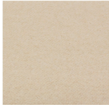
Paper Napkin Eco "Recycled" 20x20cm 2C REF. 10087-90